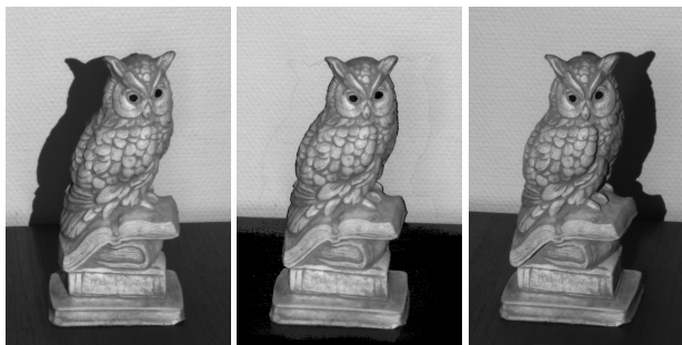
Figure 1. Example of a synthesized image from the projector’s point of view (b), along with the camera images the intensities are sampled from (a, c).

detect motion is not better in the peripheral vision [10], the speed of visual processing does increase in the peripheral vision [3]. When something moves differently compared to the movement of the observer, it becomes a powerful cue to attract attention, especially in the periphery of the visual field [12]. This is referred to as a relative-motion cue. Our idea is to guide attention by creating apparent relative-motion cues in a scene by means of a light projector that modifies the appearance of a physical object to make it look as if it were moving, thereby creating illusory motion.